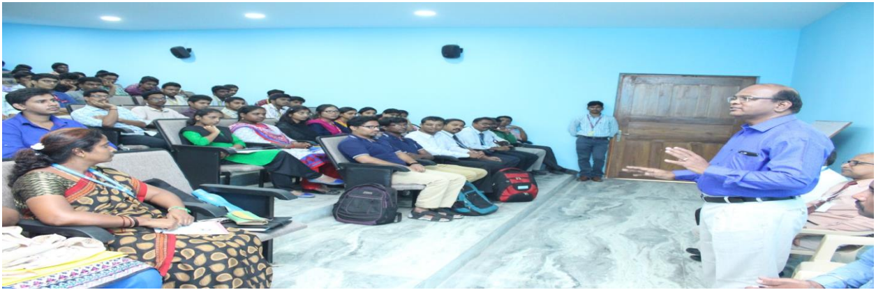
One Day MSME certification course programme - Digital Marketing on 22 nd March 2018

One Day MSME Certificate Course Programme titled " Digital Marketing " organized by Entrepreneurship Development Cell, Sathyabama Institute of Science and Technology in association with Micro Small and Medium Enterprises, Product, Process and Development, Ministry of MSME, Agra for the students of our institute on 22 nd March, 2018.