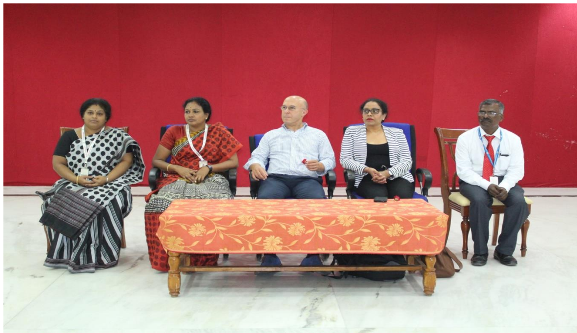
Smart Manufacturing held 9 th October, 2017