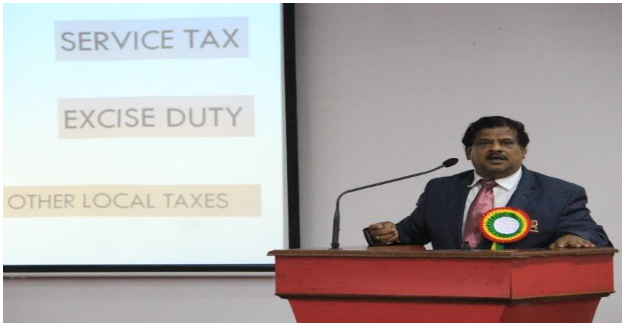
GST and Employment Opportunities dated on 14 th July, 2017