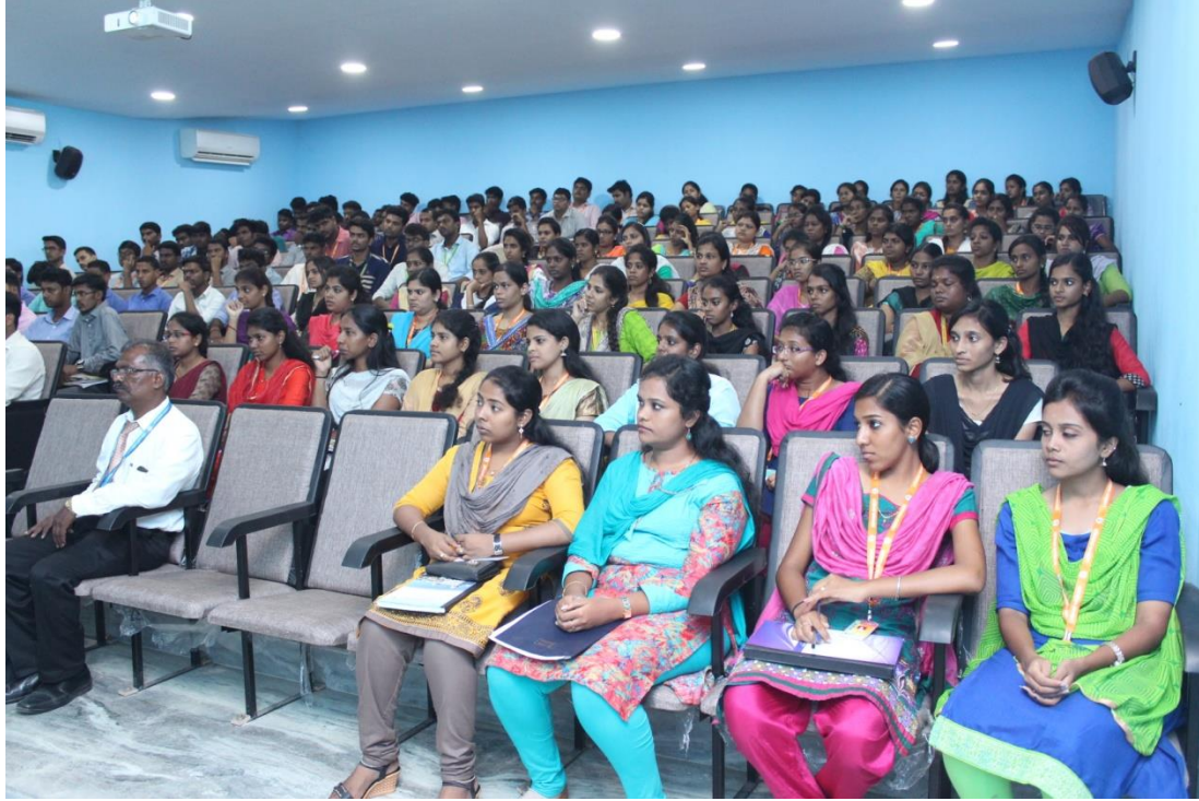
Consumer Awareness 11 th August, 2017