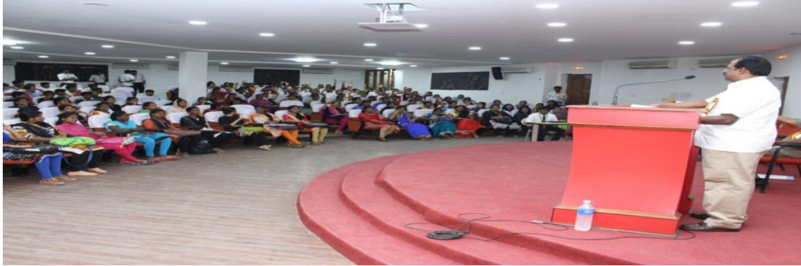
GST and Employment Opportunities dated on 14 th July, 2017