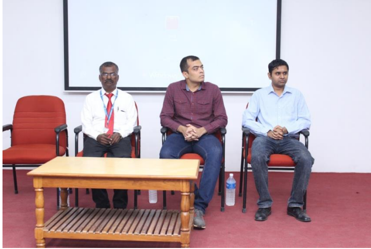
Entrepreneurship Awareness Programme, 13 th October, 2017