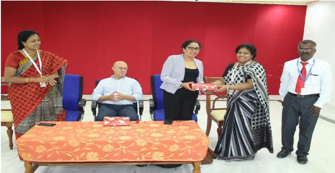
Smart Manufacturing held 9 th October, 2017