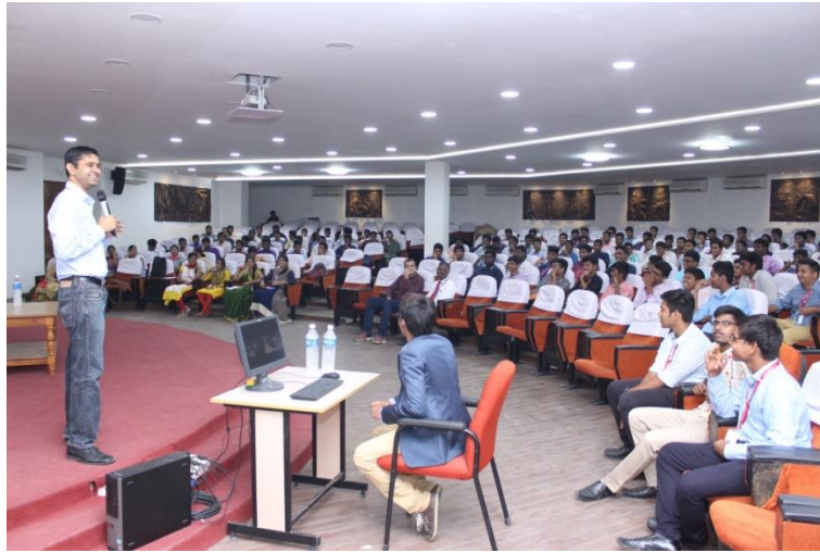
Entrepreneurship Awareness Programme, 13 th October, 2017