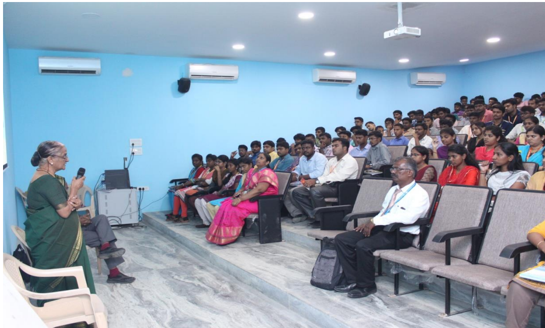
Consumer Awareness 11 th August, 2017