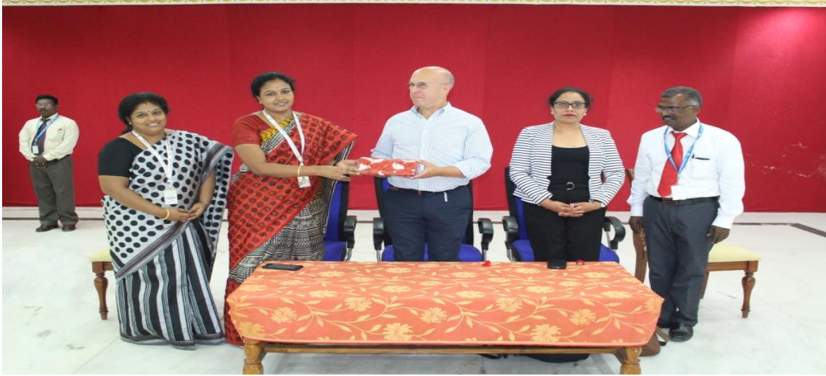
Smart Manufacturing held 9 th October, 2017