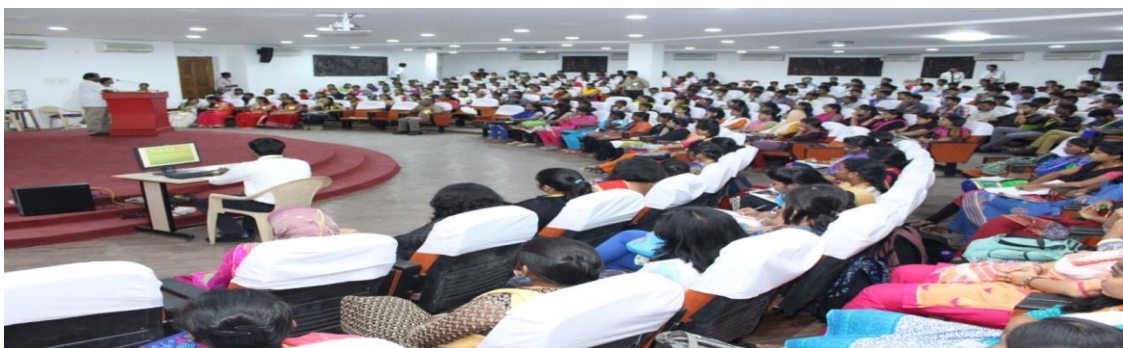
GST and Employment Opportunities dated on 14 th July, 2017