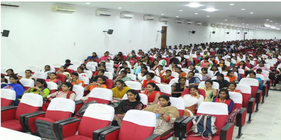
Smart Manufacturing held 9 th October, 2017