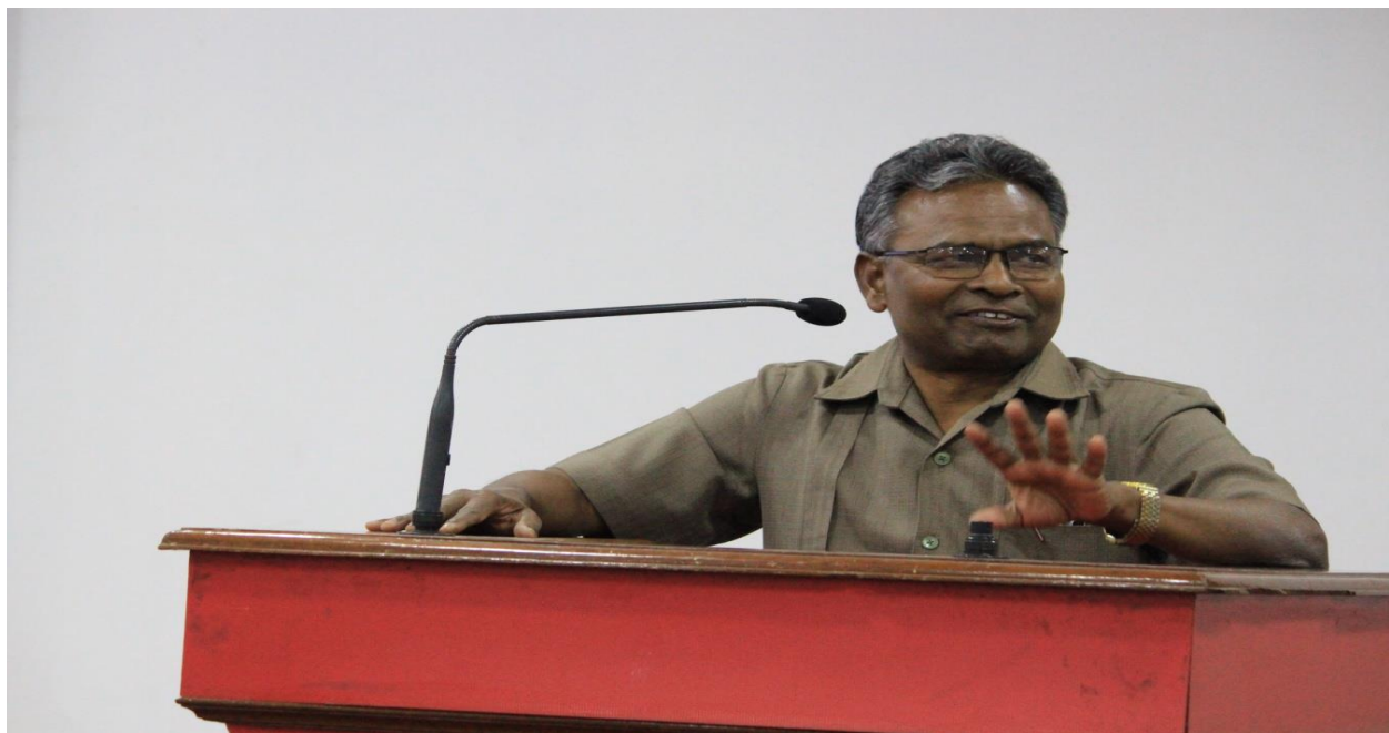
GST and Employment Opportunities dated on 14 th July, 2017