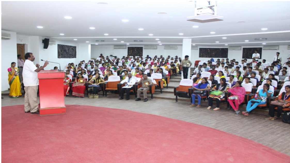
GST and Employment Opportunities dated on 14 th July, 2017