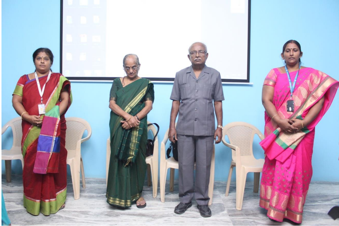
Consumer Awareness 11 th August, 2017